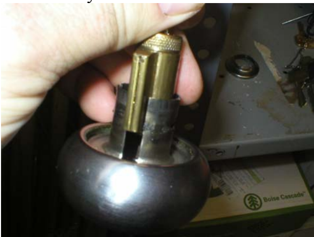
14. Slide cover back over back of knob.