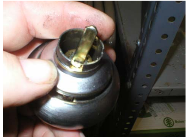
15. Make sure cover is fully seated on knob (keeps the sharp edges from cutting someone).