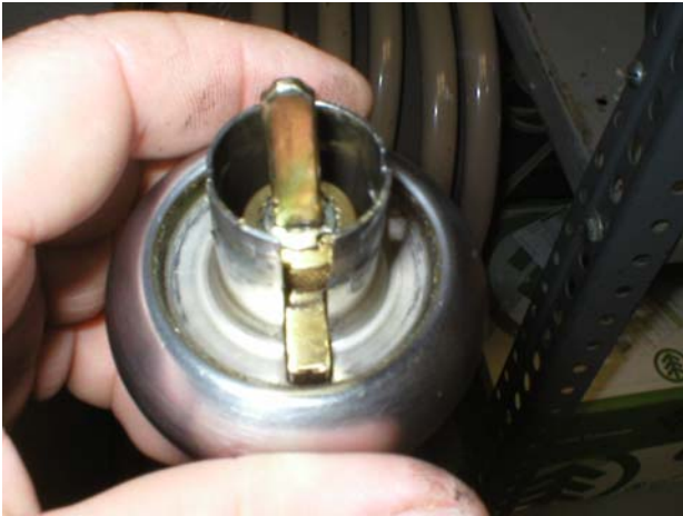
12. The lock cylinder in hand to rekey or replace.