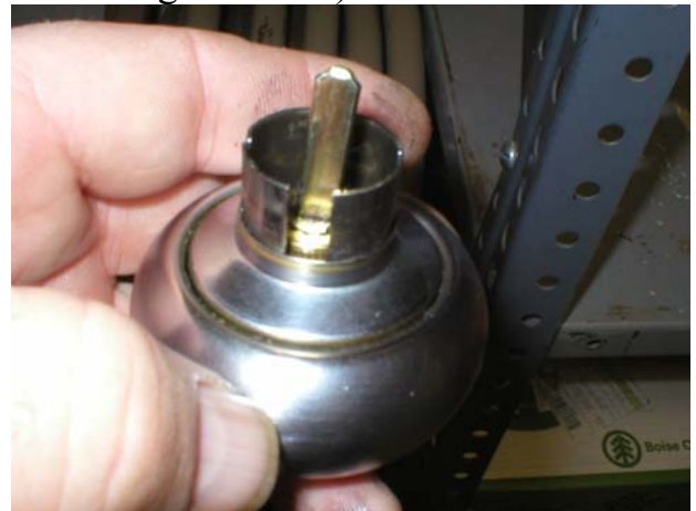
16. Check the slot in the spindle for tailpiece of cylinder.